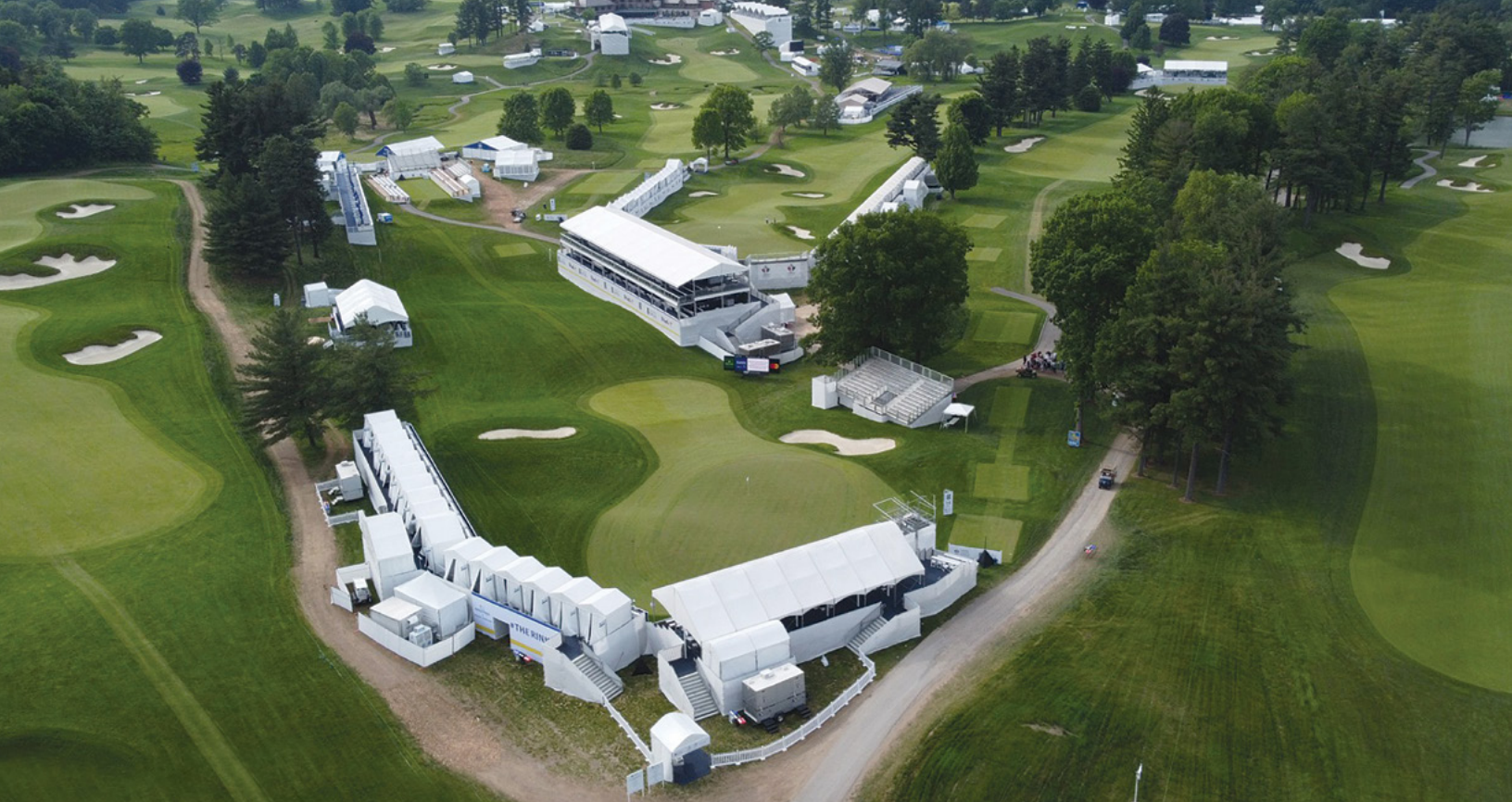
Drone shot of the RBC Canadian Open staging at Hamilton G&CC.