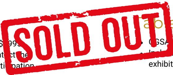
Table Top Rates: